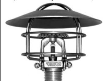
Upright Intermediate Level Sprinkler (with Guard and Water Shield)

Order Water Shield Separately. (Field Assembly Required.) See Installation Instructions.) Order Sprinkler Guard Separately or Factory Installed. (See Ordering Instructions.)