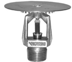
Upright Intermediate Level Sprinkler (Factory pre-assembled only)

Viking Technical Data may be found on The Viking Corporation's Web site at http://www.vikinggroupinc.com . The Web site may include a more recent edition of this Technical Data Page.