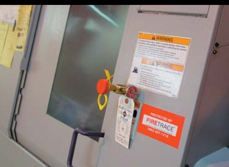
Optional manual release