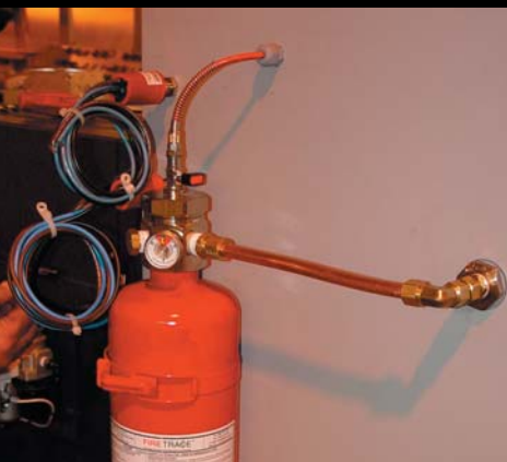
Mounted Firetrace system including pressure switches